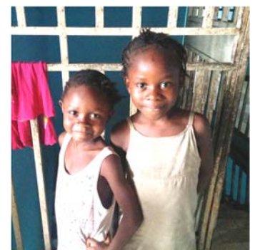
Princess and Sia