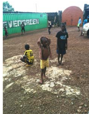
Soccer game in the compound

what is their constrains. However its a huge job and we have to submit these information to the ministry of social welfare by the end of month