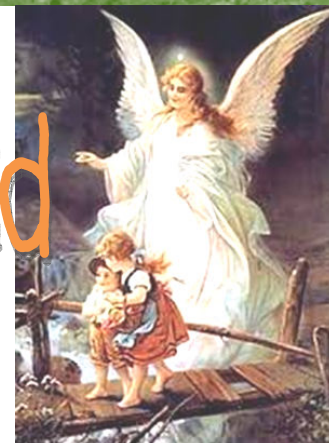
Holy Angels, Pray for us!